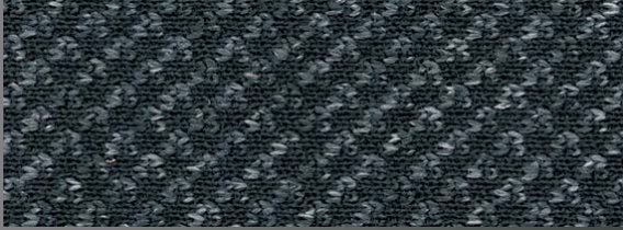
Gray/Black Fabric - Textured - "Slip Resistant"