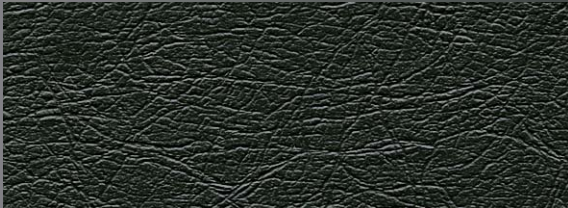
Black Leather Grain Vinyl