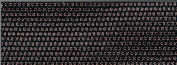
Brown Tweed Fabric Smooth