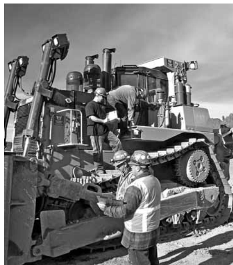
Pictured are trainers conducting a machine walkaround on a Cat Track Type Tractor.

Thompson Creek Mine is one of the four largest open pit, primary molybdenum mines in the world. Thompson Creek plays an important global role. The mine's annual production of 15 to 20 million pounds of molybdenum represents 6% of the world supply. The company's honored environmental commitment has set an example for mining operations throughout the world.